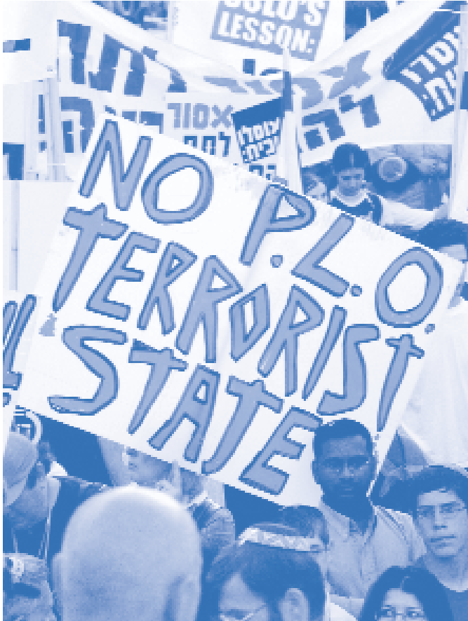
Israeli citizens display their disapproval of President Bush's Road Map to peace plan.