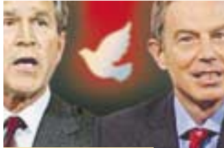
Arafat’s recent appointment of a new Palestinian Prime Minister – Mahmoud Abbas – was praised by Bush and Blair.