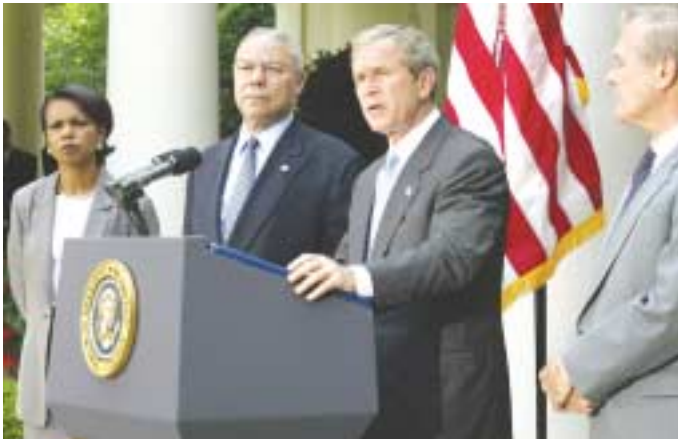
U.S. President George W. Bush announces his plan for the peace in the Middle East as National Security Advisor Condoleezza Rice (L), Secretary of State Colin Powell (2nd L) and Secretary of Defense Donald Rumsfeld (R) listen.

He should have told the Palestinians clearly and unequivocally that their 21-month campaign of violence against Israel is unacceptable and must conclude before any discussion of rewards can be started. Instead, the President outlined his