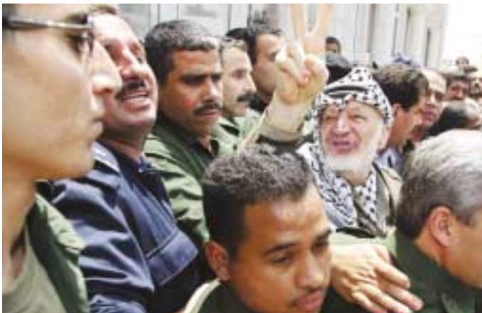
Palestinian leader Yasser Arafat gestures with a victory sign to well-wishers after leaving the central mosque after Muslim prayers in the West Bank town of Ramallah.

Well, I suppose I should, but to be honest about it, I don’t. Why not? Why don’t I care about the Palestinians? The answer is NOT any of the following.