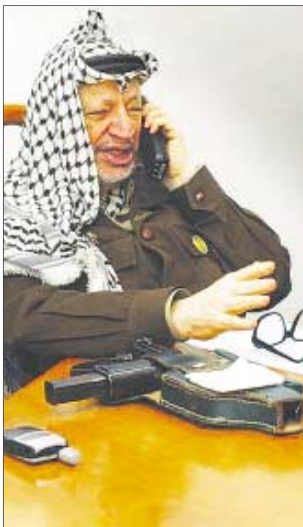
Palestinian leader Yasser Arafat talks on the phone at his office in the West Bank town of Ramallah. Sporadic gunfire and tank shell fire was heard as Israeli forces entered Ramallah, surrounding Arafat’s compound and occupying some rooms within the building.

Some Arabs (those among the minority who acknowledge that Arabs are