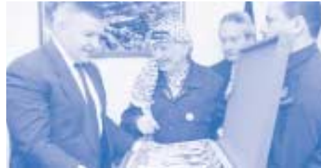
Palestinian leader Yasser Arafat (C) gives U.S. Middle East envoy Anthony Zinni (L) a gift from the town of Bethlehem, as they dine at Arafat's headquarters March 19, 2002 in the West Bank town of Ramallah. Zinni met with Arafat at the same time U.S. Vice President Dick Cheney was meeting with Israeli Prime Minister Ariel Sharon.

Not three months have passed since Israel captured, and Arafat lied to the president about, the ship bearing 50 tons of arms from Iran, a member of the “axis of evil,” to Arafat. And yet today U.S. policymakers, with their singularly limber imaginations, imagine that it is important to coax from Arafat yet another disavowal of violence.