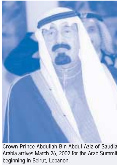
Crown Prince Abdullah Bin Abdul Aziz of Saudi Arabia arrives March 26, 2002 for the Arab Summit beginning in Beirut, Lebanon.

— The Palestinians are said to be chafing under the “occupation.” But in obedience to the Oslo process, Israel has given administrative authority over 98 percent of the Palestinians in the disputed territories to Arafat. Israel has further permitted the Palestinian Authority to arm 40,000 “police.”