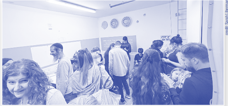
Israelis sheltering at IKEA

At first, we didn't know what to do. Within seconds, however, an employee guided us to a shelter. About 25 people — mothers with young children, elderly adults, and others — stood quietly and calmly. There