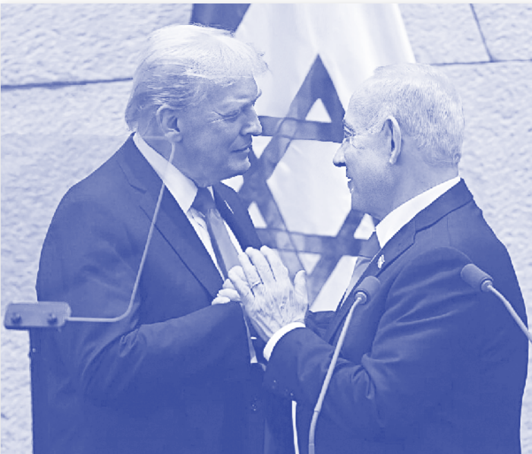
President Donald Trump and Prime Minister Benjamin Netanyahu at the Israeli Knesset on Oct. 13, 2025