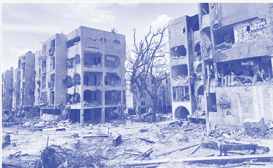
Site of an Iranian missile attack in Arad (Southern Israel) where Sarah's children have volunteered

These munitions have proven difficult for Israel's air defense systems, since the main missile disperses its payload before interception can occur. Most Israeli injuries during this war resulted from these cluster rockets. Tragically, many casualties occurred when people didn't reach a shelter quickly enough or failed to close the shelter door in time.