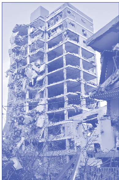
Destruction in Bat Yam, south of Tel Aviv, after Iranian missile strike on June 15, 2025

In the days and nights that followed, Israeli jets carried out precision strikes against Iranian military installations, which asserted Israeli air dominance over western Iran and Tehran within days. Later, the Israeli Air Force struck Iran's storage facilities and missile launchers that were aimed at Israel. After about a week, it was time to address Iran's primary nuclear facilities.