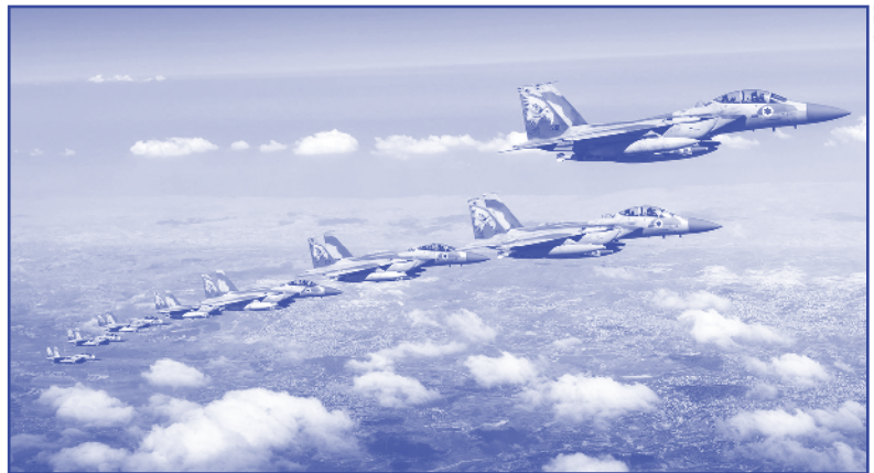
Israeli Air Force fighter jets on their way to attack Iran in June 2025

Once inside our safe room, we realized that it was no longer "war ready." After the Hezbollah attacks ended nine months earlier, we had removed most food and survival supplies, and our boys had reclaimed it as a workout room. At 3:00 that morning, however, we knew that major changes needed to be made to accommodate longer stays. A war with Iran was not a joke.