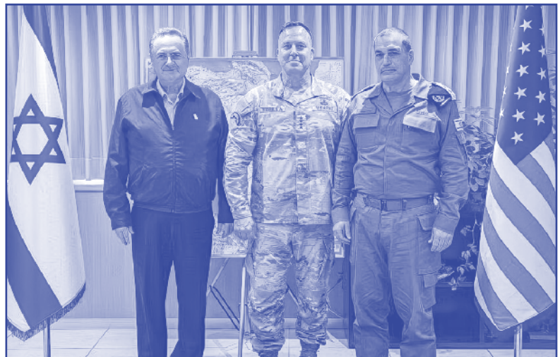
Israeli Defense Minister Israel Katz, CENTCOM Commander General Michael Kurilla, and IDF Chief of Staff Lieutenant General Eyal Zamir

Since October 7, 2023, Kurilla has spent considerable time in the Middle East. He fostered a quiet alliance among moderate Sunni nations and Israel, emphasizing coordination via CENTCOM rather than formal NATO-style pacts. This cooperation enhanced regional intelligence sharing and defense readiness.