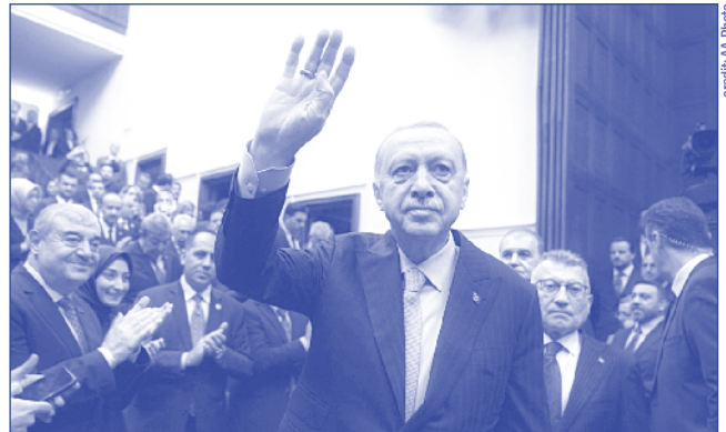
Turkish President Recep Tayyip Erdoğan greets supporters at the Justice and Development Party parliamentary group meeting on March 26, 2025.

While Erdoğan is not concerned about Russian attacks (one of the reasons that NATO was founded), Turkey's NATO membership allows it the benefits of military training, intelligence, and sophisticated technological prowess from the U.S. and other Western countries.