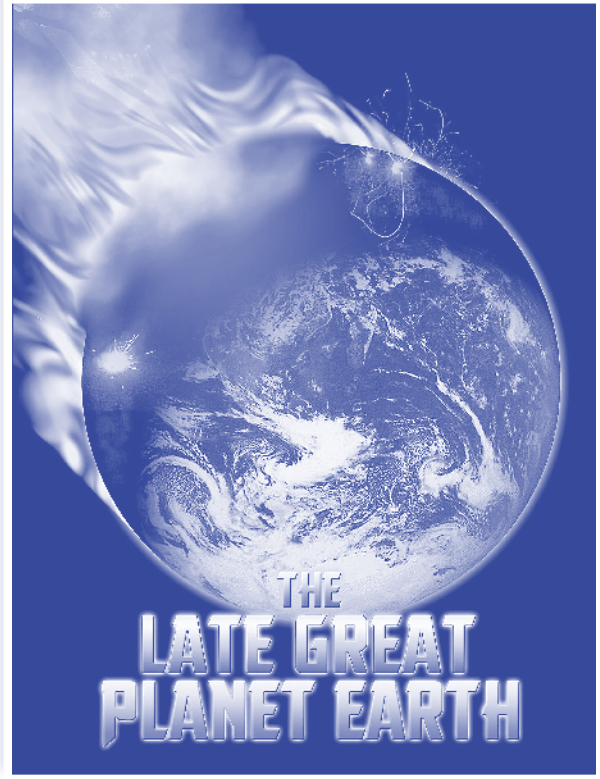
The Late Great Planet Earth book, written by Hal Lindsey (1929–2024), sold over 15 million copies. The movie was released in 1978.

These two influences resulted in a series of recurring dreams about the persecution of Believers* during the End Times, which I remember vividly to this day. I dreamt about people living and hiding in and under a clump of massive trees in a vast field. In another dream, I recall seeing families “running for the hills” eastward in the desert. And in yet a third dream, threatening men in uniforms ferreted out people from hideouts behind false white plaster walls in homes. I dreamt of Believers being caught and taken to prison, where I knew that they would face interrogation and execution.