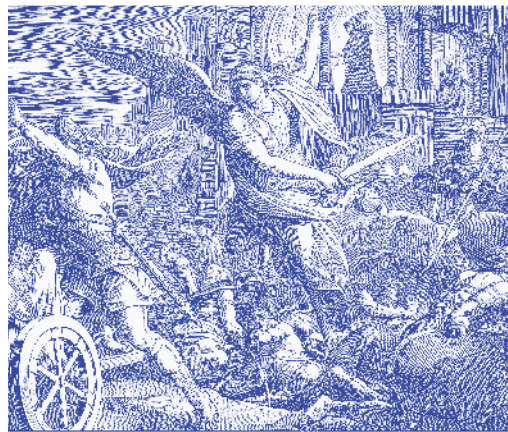
Jerusalem Delivered from Sennacherib , woodcut for Die Bibel in Bildern (1860), by Julius Schnorr von Carolsfeld (1794-1872)

Although Satan designs Hamas's parades and psychological torture to signify victory, those charades are no more than the reflexes of a roaring lion . He's backed into a corner, stiffening his posture and raising his fur in order to look more formidable. This is why we have hope — even better, anticipation! Hamas has sealed their fate. Satan's last-ditch plan to break the hearts of God's people has only accelerated the coming judgment on Hamas. The account of King Hezekiah's showdown with the Assyrian King Sennacherib illustrates the reality of what is about to happen in Israel.