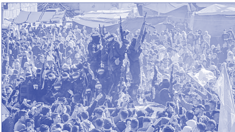
The hostages endured jeers and shouts from the crowd as Hamas terrorists swarmed around them on January 25, 2025.

The torment continued on January 25 as Hamas released the second group of hostages — four young, female IDF soldiers. After being seized from their beds, these women experienced