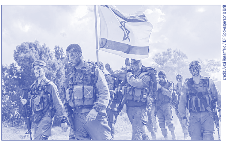
IDF soldiers finish their beret march following eight months of training

Military service is not just about great opportunities. It can be dangerous. Though the October 7 atrocities were horrible enough, the massacre also started a war. Here in Israel, we wake up daily to photos of newly fallen soldiers. Seeing pictures of young men who gave their lives for our protection has become a heartbreaking routine. Some days are more difficult — like January 22, when 21 IDF soldiers died