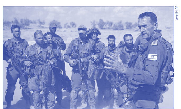
IDF Chief of Staff Lt. Gen. Herzi Halevi (right) addresses troops in southern Israel on October 15, 2023

Because most airlines suspended flights to Israel by the evening of October 8, many young adults struggled to get to Israel. On airline flights that were still operating, many families and business travelers who had tickets voluntarily gave up their seats so that reserve soldiers could return. El Al, Israel's national airline, flew special aircraft to several key cities such as Hong Kong and New York and then returned to Israel with reservists. The