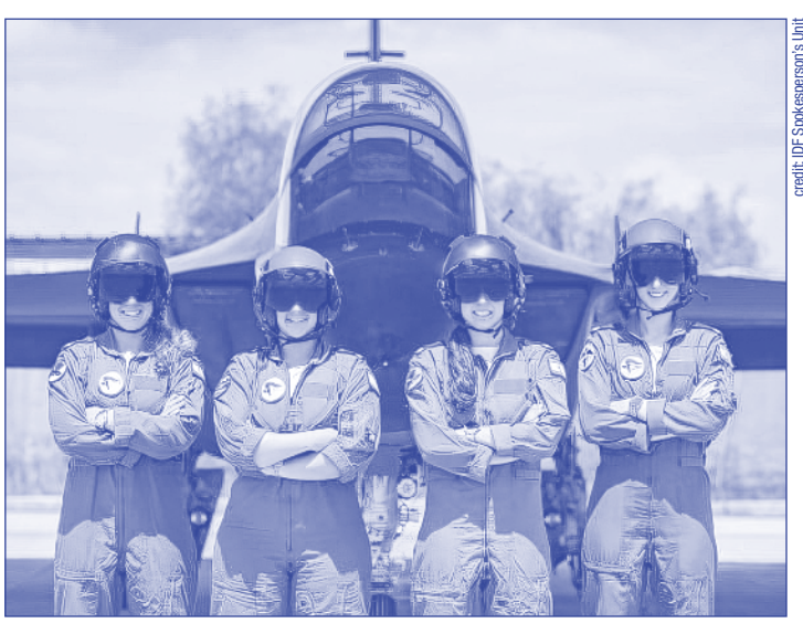
Four female pilots from the June 2021 graduating class of the IAF Flight Academy

Typically, five or six months pass before the second day of testing, but our son received