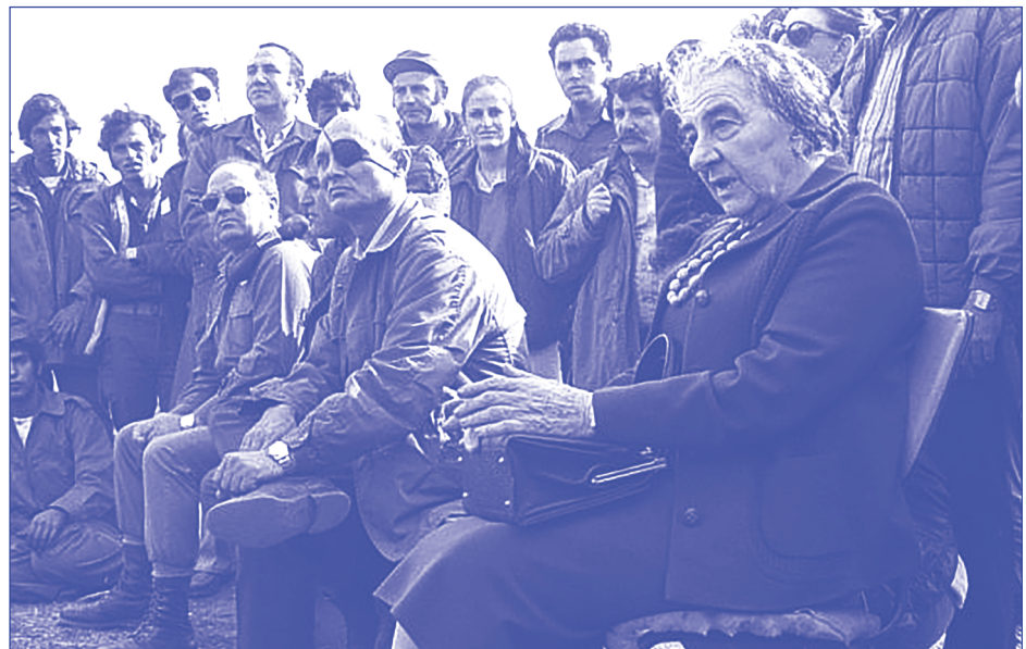
Defense Minister Moshe Dayan and Prime Minister Golda Meir

Throughout 1973, Meir had received several warnings that Egypt would attack Israel. The newly released documents show that she sought negotiations between Israel and Egypt — at least 15 times — to prevent a war. After losing in 1967's Six-Day War, however, Egypt wanted to redeem itself by defeating Israel in another war. Thus, the Egyptians involved Syria and began massive military training in the Sinai desert.