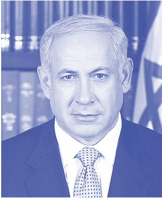
Prime Minister Benjamin Netanyahu

affirmed the plan to “reclaim their historical land from the river to the sea” — from the Jordan River to the Mediterranean Sea. Also increasing are the Palestinian calls to use violence in taking the land and eradicating the Jewish state.