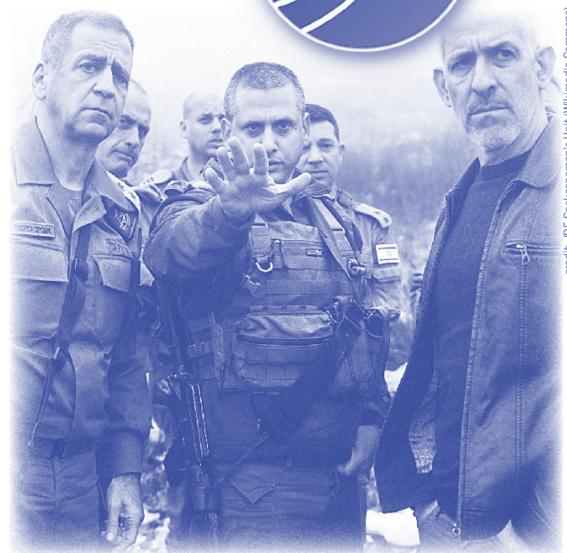
Ronen Bar (right), director of Shin bet, meeting with team members after the shooting attack in northern Samaria in December 2021

Before Passover this year, Prime Minister Benjamin Netanyahu publicly addressed the head of the Shabak and commended its service: "Your performance is one of the best in the world; everyone comes here to witness it and learn."