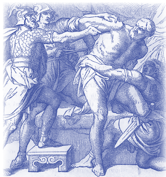
Samson bound by the Philistines, engraving by an unknown artist for The Story of the Bible from Genesis to Revelation (1873)

Later, he was the designated “entertainer” in the temple of Dagon, a Philistine god. Over 3,000 Philistine men and women drank and celebrated Samson’s capture and humiliation — and the end of their struggle against Israel.