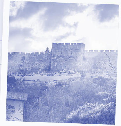
The Eastern Gate of the Temple Mount in Jerusalem

In our 15 years of traveling to the Holy Land, we have always felt at ease. Our sense of peace is thick. While in Israel, we see young children happily walking home from school, and women walking and jogging alone with confidence. Certainly, they have problems there, just as we do in the U.S. — crime and hate exist everywhere. Still, we're wise about where we go and what we do. Our Zola Tours' pilgrims have always felt safe in every situation.