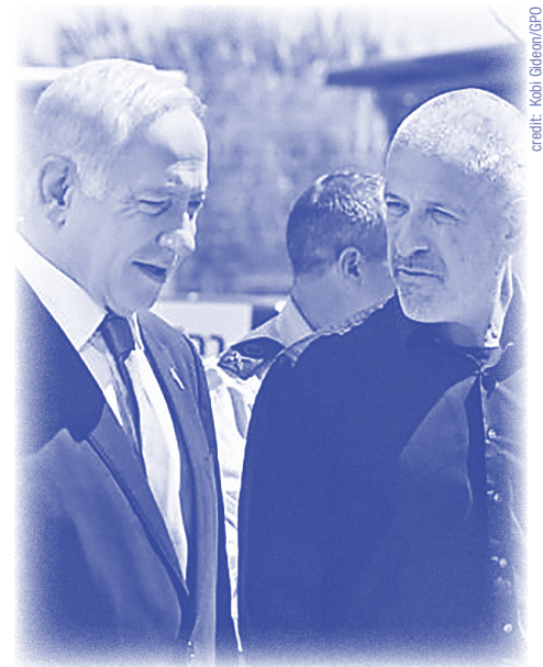
Prime Minister Benjamin Netanyahu with Ronen Bar

We continue to experience terrorist attacks in Israel, which are now primarily shootings and stabbings. Thus far in 2023, Tequila teams have prevented 14 terrorists from completing their planned attacks.