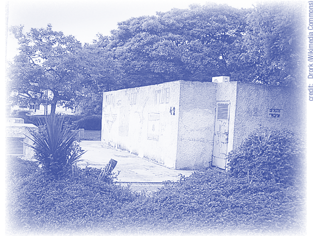
A public air raid shelter in a garden in Holon, Israel

Every citizen received a kit with a gas mask and a quick-release atropine syringe, along with training about using the atropine pen if chemicals were released in a blast.