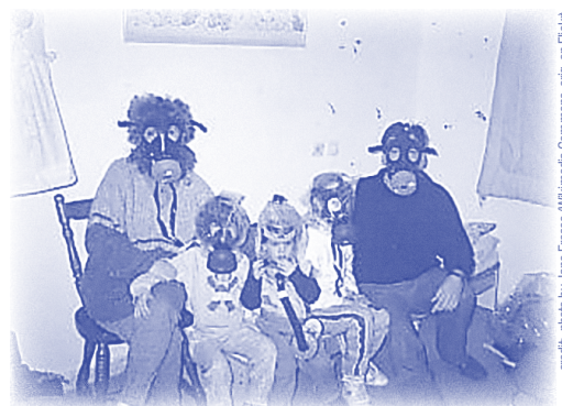
An Israeli family in a shelter during the Gulf War, 1991

While Iraq fired 39 Scud missiles on Israel during that seven-month war, thankfully none carried biological or chemical warheads. Nonetheless, since those “sealed rooms” were ineffective against conventional rockets, each new home subsequently was required to have a mamad . Moreover, every existing home that is renovated must add one to protect its residents from both conventional and chemical attacks.