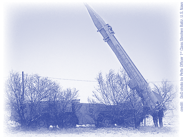
A Scud missile at a joint military training exercise in Roswell, N.M., on April 26, 1997