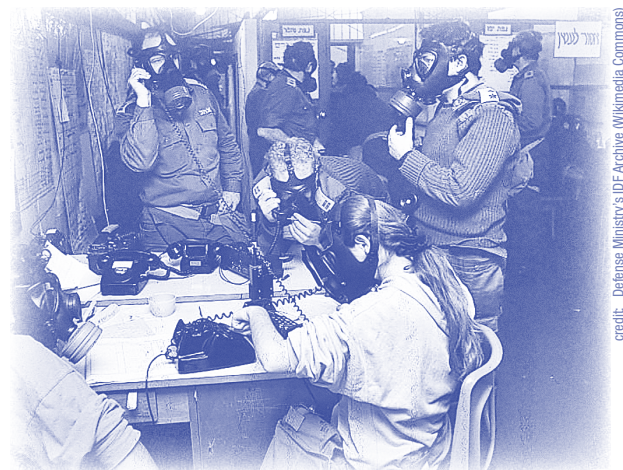
Israeli soldiers work in a command center wearing gas masks during the First Gulf War in 1991