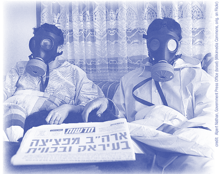
An Israeli family in its sealed room, with gas masks, during the 1991 Gulf War (the newspaper's headline reads "USA bombs in Iraq and Kuwait")

If you visit a home in Israel, you will likely see one of these rooms. Yet most people convert them to a storage room or a child's bedroom. In our house, our youngest son's bedroom is in our mamad . I am thankful that during the time my children have grown up here, we haven't had any major wars and we have not had to use the room for its intended purpose.