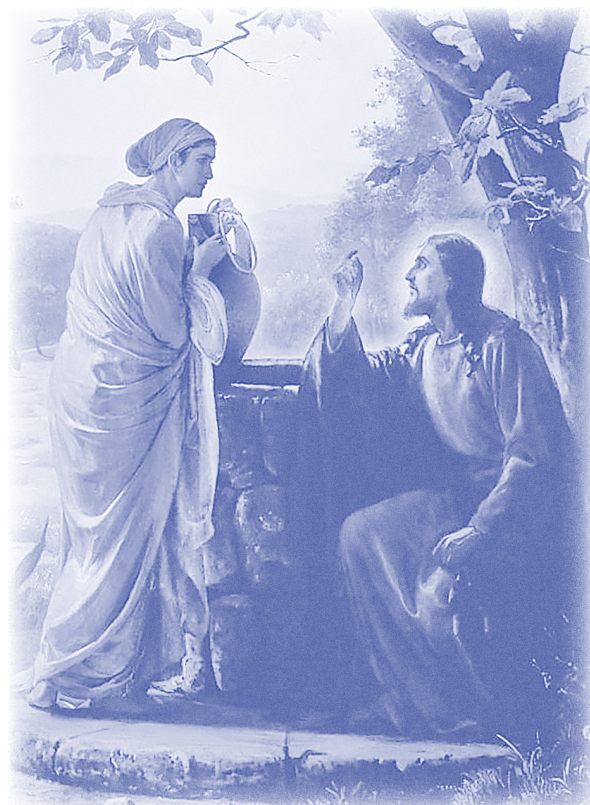
Detail of Woman at the Well painting by Carl Heinrich Bloch (1834–1890) from the Chapel at Frederiksborg Palace in Copenhagen

Most rabbis in Israel also hold them in low regard. These religious leaders do not recognize the Samaritans' customs or obedience to the Law of Moses as signs of their connection to the nation of Israel. As a result, Jews and Samaritans continue in an antagonism similar to what their ancestors experienced in the first century.