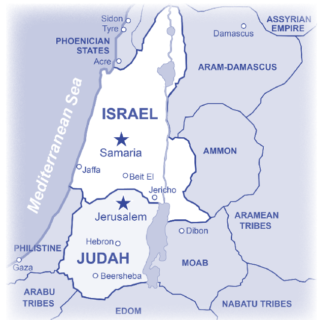
Map of Israel and Judah in the 9th century BCE

The people of Samaria sought to undermine or stop any restoration. While they failed, their opposition intensified the animosity between them and the Jews in the south. Throughout the centuries that followed, the southern Jews had a “holier than thou” attitude toward the Samaritans, whom they considered no longer Jewish.