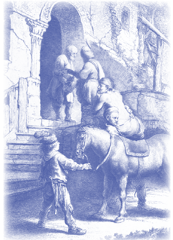
Detail of The Good Samaritan (1633) etching by Rembrandt, The Metropolitan Museum of Art, New York

Recently, I was on such a tour bus. We left the Mount of Olives and began the long descent eastward toward the Dead Sea—the lowest point on Earth. Shortly after we left Jerusalem, our guide pointed out a sizable stone building that was owned and operated by the Catholic Church.