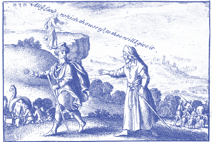
Abraham and Lot Separate , 17 th century engraving by Wenceslaus Hollar (Thomas Fisher Rare Book Library, Toronto)

When Abraham and Lot decided to part ways, Abraham gave his nephew first choice of the land. Genesis 13:10 states, “Lot looked around and saw that the whole plain of the Jordan toward Zoar was well watered, like the garden of the Lord, like the land of Egypt. (This was before the Lord destroyed Sodom and Gomorrah.)” Therefore, what do the Garden of Eden, the plains of Jordan (Aravah), and Egypt all have in common? They are all watered well by a river.