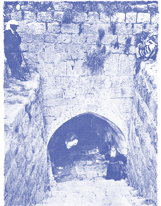
The Gihon Spring or Fountain of the Virgin