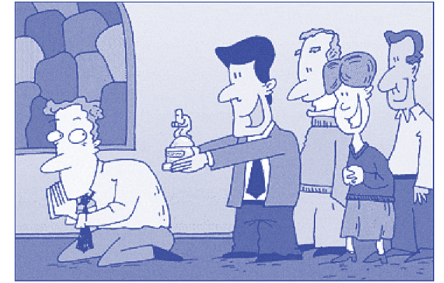
CONGRATULATIONS ... YOU HAVE BEEN VOTED THE MOST VALUABLE PRAYER

your brethren—Believers and unbelievers alike. Just as your tax dollars mobilize America's military defense, your contributions to this ministry mobilize our spiritual offense.