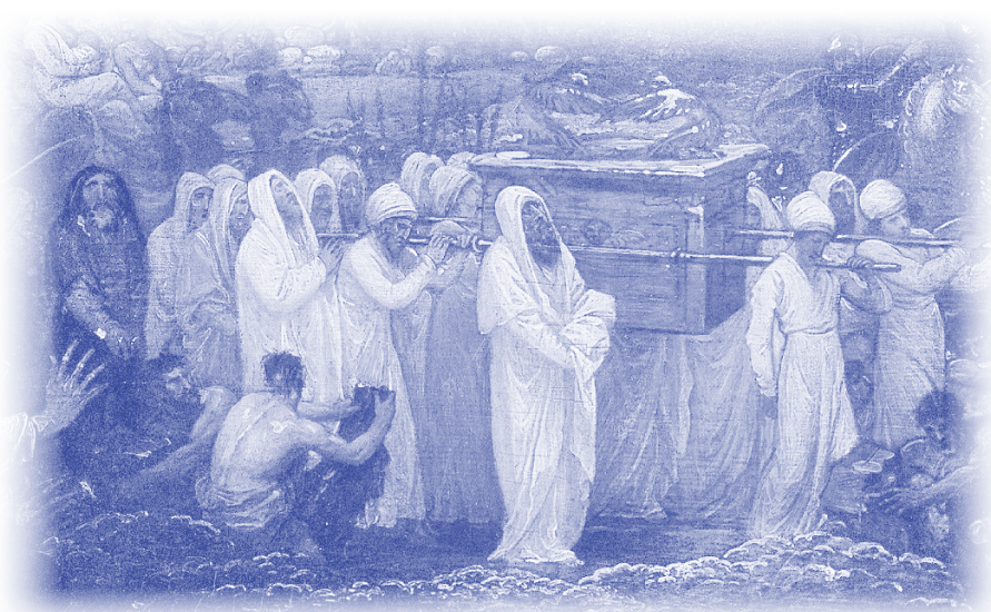
Detail of Joshua Passing the River Jordan with the Ark of the Covenant , oil on wood by Benjamin West (1738–1820), Art Gallery of New South Wales

geographical location where Yeshua was eventually immersed. It's also the same area where Elijah's fiery chariot flew to Heaven, the same place where Elisha received a double portion of Elijah's spirit, and where God parted the water for the people of Israel. Each time, ahead of fulfilling His promise, God made the impossible happen.