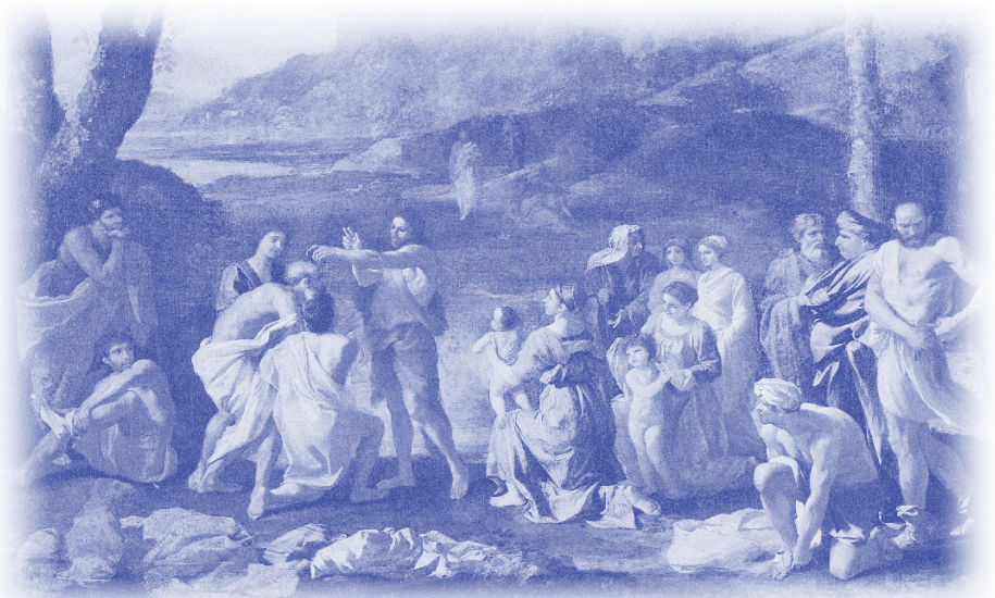
Detail of Saint John Baptizing in the River Jordan , oil on canvas by Nicolas Poussin (1594–1665), Getty Center

The new generation would take the land of their inheritance. They had waited a long time, walking around for 40 years in the desert. They circled and recircled until God considered them strong enough and mature enough to take hold of the promise.