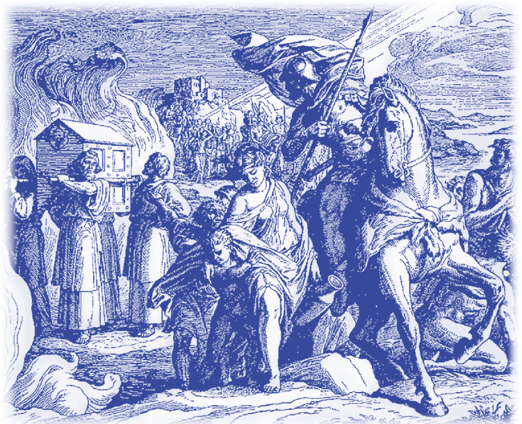
Crossing the Jordan , engraving by Julius Schnorr von Carolsfeld (1794–1872) for Die Bibel in Bildern (1860)

I haven't been able to travel for ministry for over six months, so my Ascend team (comprising young Israeli worshipers) and I created a project called iAscend. This online program conveys insight and life-transforming truth about worship, prayer, leadership, management, and creativity. We filmed content from many Bible teachers, a Believing tour guide, and different professionals — all from here in Israel.