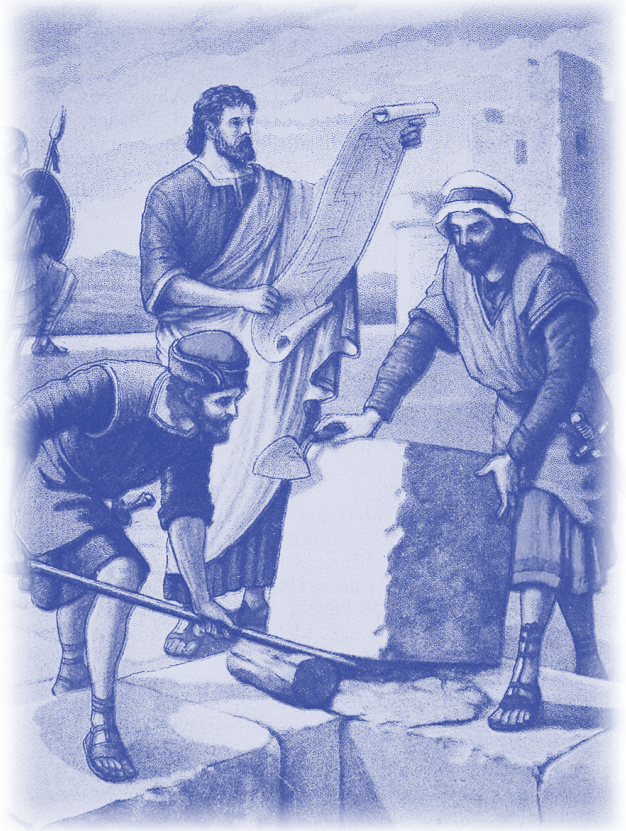
Nehemiah illustration by Adolf Hult (1869–1943) from an Old Testament Bible Sunday school primer (1919)

Nehemiah led an expedition funded by the king of Persia to rebuild the walls of Jerusalem in 52 days. He ruled over Judea and re-established proper worship in the Temple, ensuring a safe and prosperous future for the people of God in that region. He endured attacks and plots to kill him as well as ongoing opposition while facing demanding circumstances. His contribution to the people of Israel’s spiritual revival goes without question.