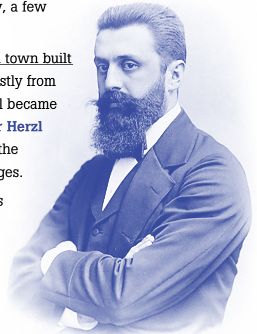
Theodor Herzl (1860–1904) in an 1897 photo by Carl Pietzner. Herzl was the founder of the modern Zionist movement. In his 1896 pamphlet The Jewish State , he envisioned the founding of a future independent Jewish state during the 20 th century.