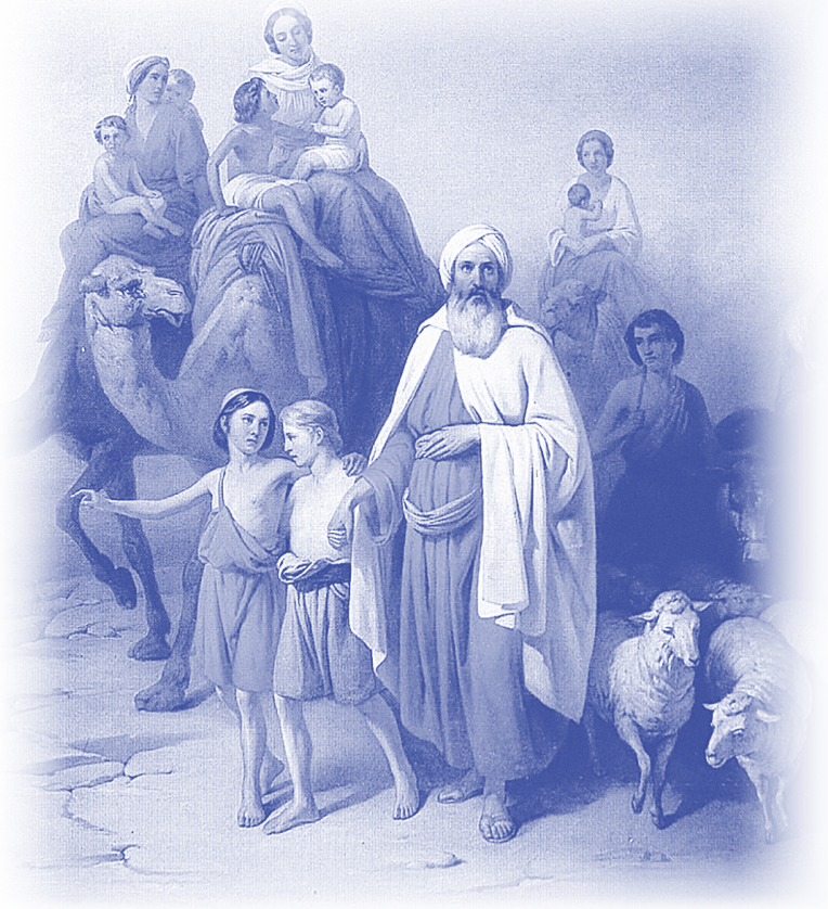
Abraham's Journey from Ur to Canaan (1850), painting by József Molnár (Hungarian National Gallery, Budapest)

The Kingdom of God is a pioneering kingdom. It advances and influences even though it began from very humble beginnings. In Matthew 13, Yeshua/Jesus compares the Kingdom of