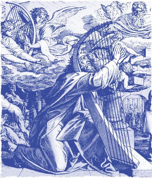
The Psalmist David: Supplication , woodcut by Julius Schnorr von Carolsfeld

In times of war, Middle-Eastern cities feared a cut-off water supply. If the city's water was secure, it could hold out against a siege. The all-sufficient grace of God is like an unending, refreshing river that will sustain the Believer until the end of the age. John wrote about it in Revelation 22:1, "And the angel showed me a pure river of water of life, clear as crystal, proceeding from the throne of God and of the Lamb."