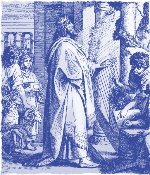
The Psalmist David: Worship , woodcut for Die Bibel in Bildern (1860) by Julius Schnorr von Carolsfeld (1794–1872)