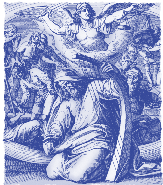
The Psalmist David: Repentance , woodcut by Julius Schnorr von Carolsfeld

We read in verse 4 that Jerusalem and the city's peace were secured by God. We can be confident that God will, one day in the future, secure the peace of