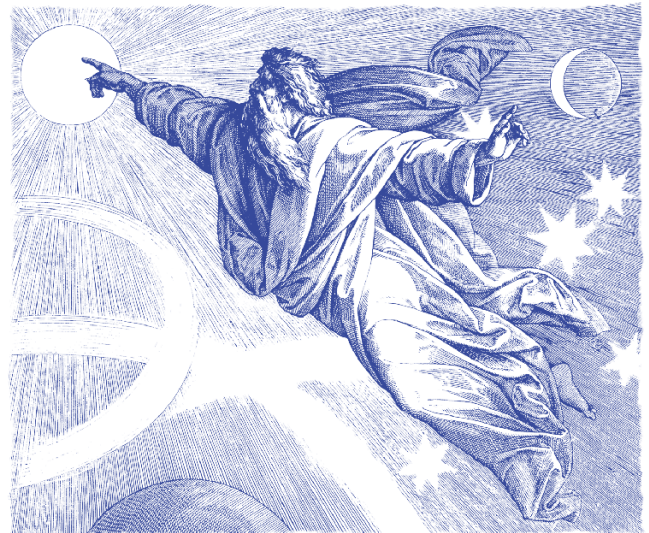
God Creates the Lights in the Heavens, woodcut for Die Bibel in Bildern , 1860 by Julius Schnorr von Carolsfeld (1794–1872)