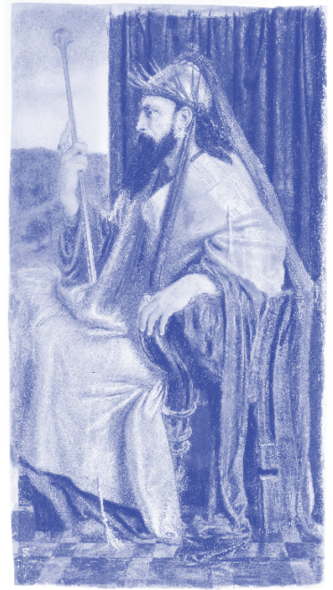
King Solomon (circa 1873) painting by Simeon Solomon (1840–1905)