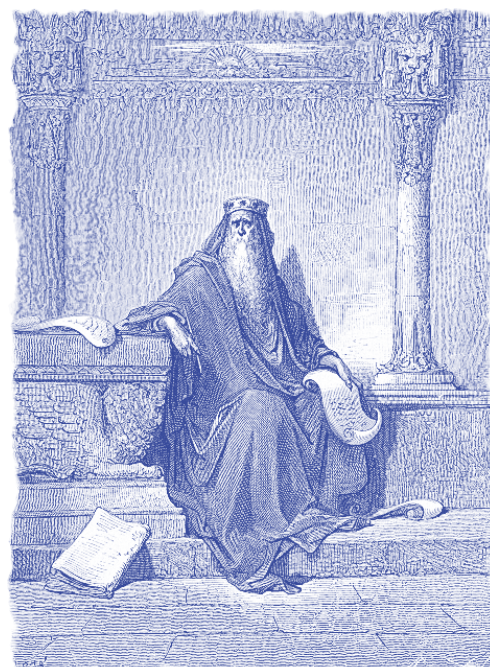
Solomon Writing Proverbs (circa 1866) engraving by Gustave Doré (1832–1883)

Verse four hits home for all of us. There is a time to weep and mourn, laugh and dance. Can you remember attending the memorial service for someone close to you, and the range of emotions you experienced? At one moment you are in tears, and then a family member tells a funny story that brings smiles and laughter. That's the point Solomon is making. We all face tragedy in life and moments that crush our spirits, but then God brings a memory that lifts that bruised heart.