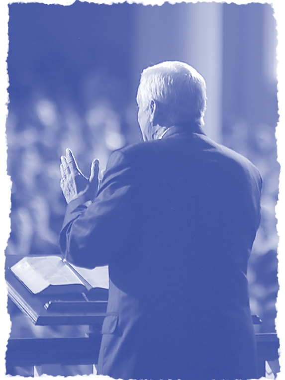
How do you spot a God-appointed minister?