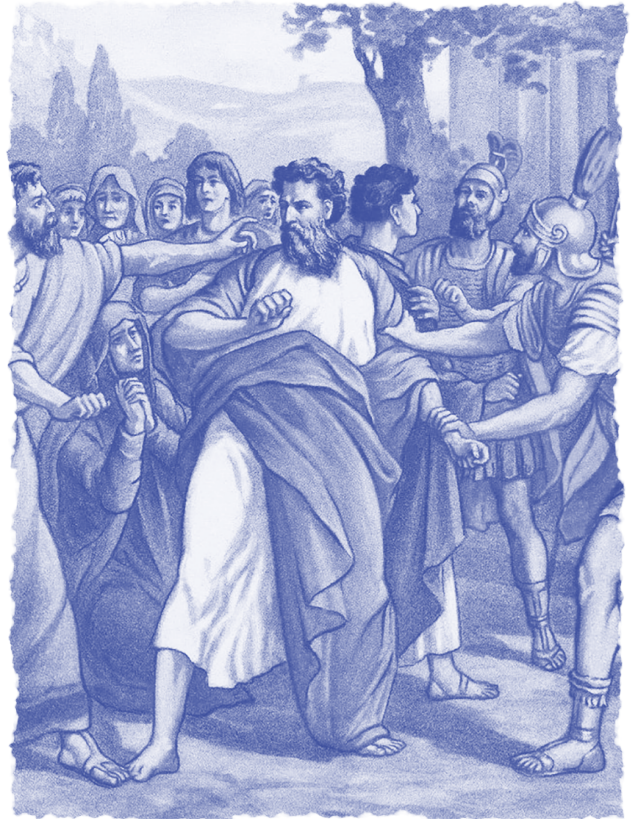
Saint Paul arrested by the Romans, printed card, illustration from early 1900s