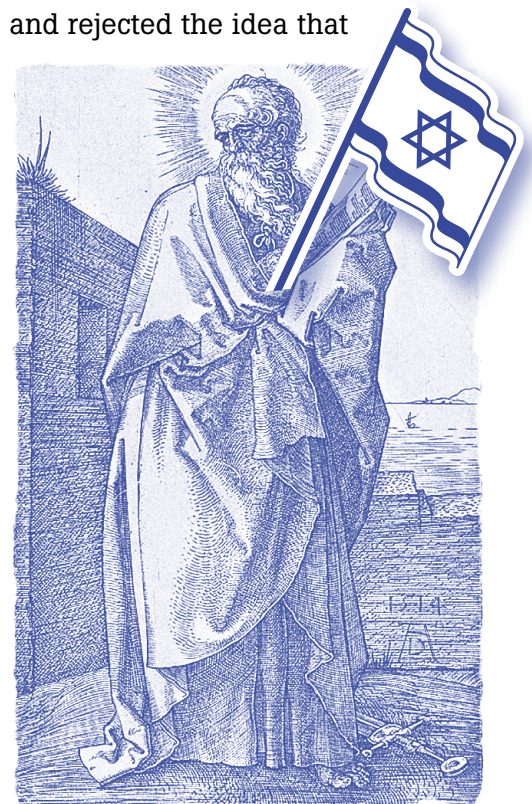
The Apostle Paul (1514) engraving by Albrecht Dürer (1471–1528), The Rijksmuseum, Amsterdam (flag of Israel added 😊)