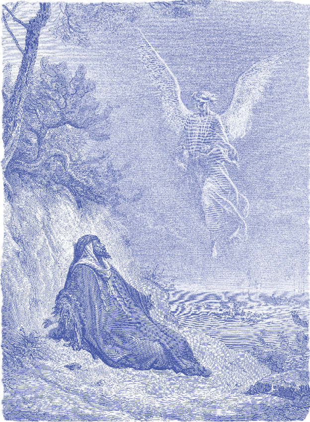
Elijah Is Nourished by an Angel , 1866, etching for Doré's English Bible by Gustave Doré (1832–1883)

"Christ Jesus came into the world to save sinners, of whom I am chief" (1 Timothy 1:15).