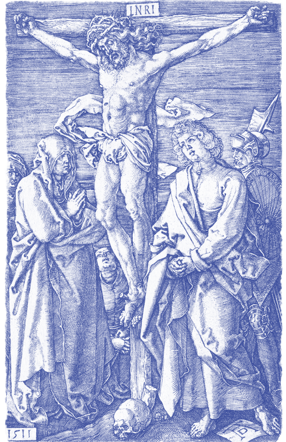
The engraved Passion series: Crucifixion (No. 11) from Die Passion Christi , 1511, by Albrecht Dürer (1471–1528), Metropolitan Museum of Art, New York

First Paul quotes the words Moses spoke to Israel at the covenant renewal in Moab. After reminding the people about all that God had done for them in bringing them out of Egypt, and the continuing evidences of God’s grace, Moses told them: “Yet the Lord has not given you a heart to perceive and eyes to see and ears to hear, to this very day” (Deuteronomy 29:4).