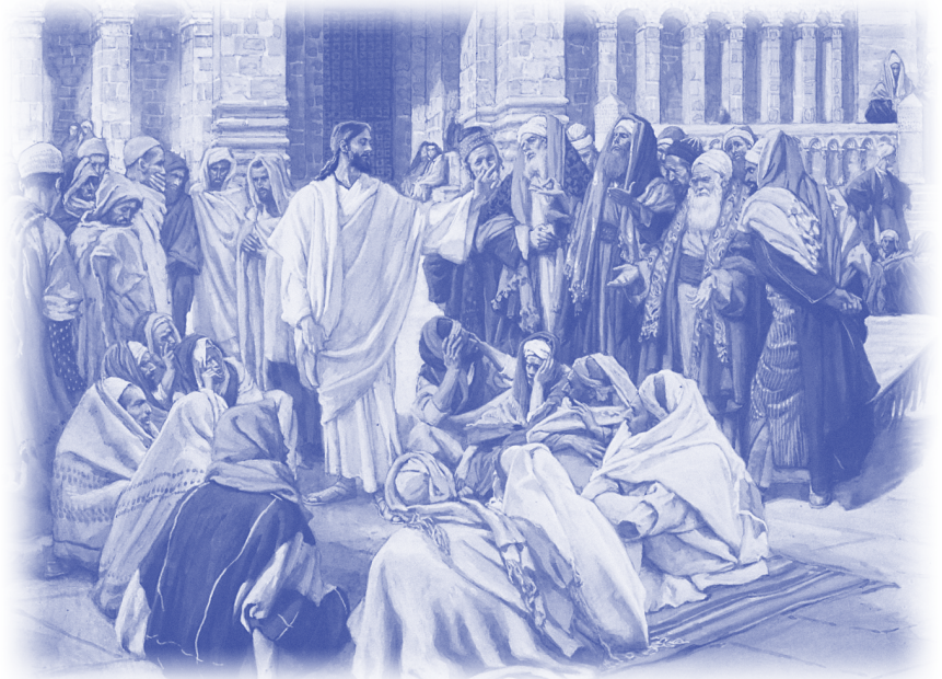
In The Pharisees Question Jesus , the rich Pharisees stand and oppose Yeshua while the poor and the disciples sit and humbly listen. Watercolor by James Tissot (1836–1902), The Brooklyn Museum

There should never be a difference in the faith that a Believer professes and the action that he takes in life. We all look different, talk, dress, and eat differently, and respond in life differently. Our existence would be dull and boring if we were all alike!