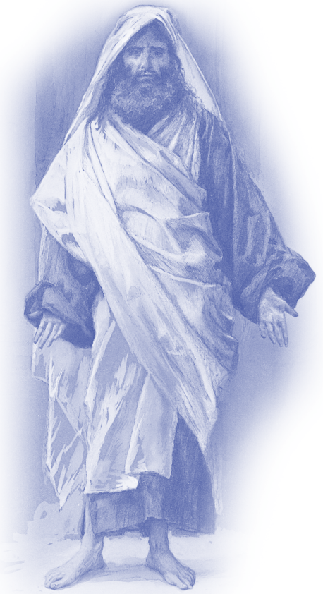
Saint James Major, James Tissot (1836–1902), The Brooklyn Museum