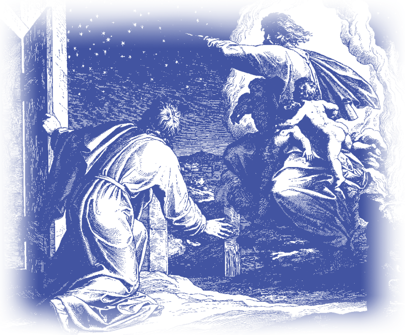
God's Promise to Abraham , by Julius Schnorr von Carolsfeld (1794–1860), woodcut for Die Bibel in Bildern , between 1851 and 1860

I reconsidered my "knee jerk" answer, and then remembered a verse in the Bible in Acts 13:17, "The God of this people Israel chose our fathers, and exalted the people when they dwelt as strangers in the land of Egypt, and with an uplifted arm He brought them out of it." Apparently, my "knee jerk" reaction was spot on — God's choice was His sovereign will.