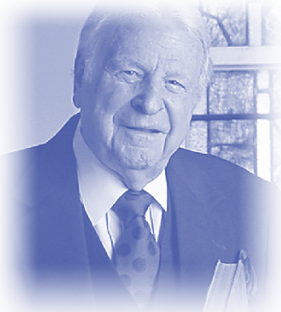
Dr. W.A. Criswell (1909–2002)

The Pharisees wanted places of authority and recognition while counterfeiting the law with their personal interpretations. Sound familiar?