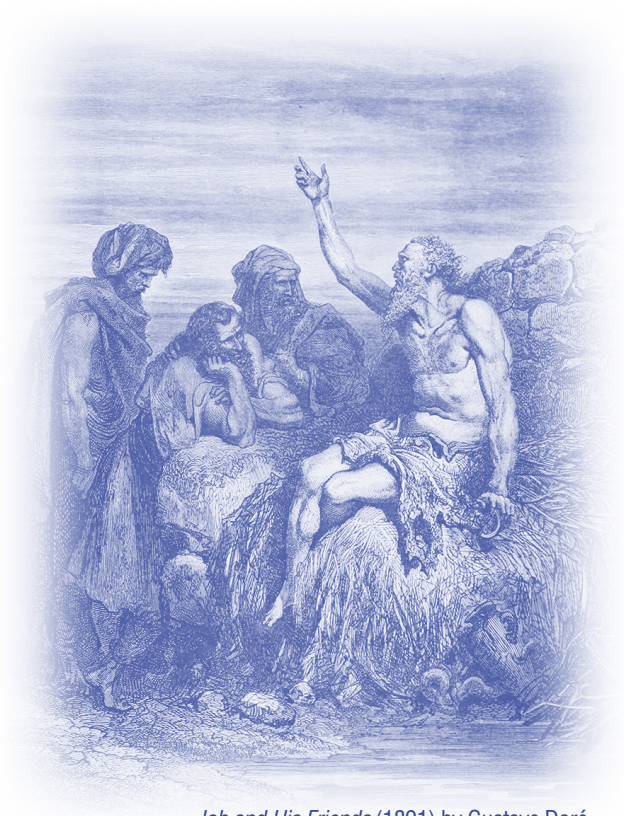
Job and His Friends (1891) by Gustave Doré for La Grande Bible de Tours

Christendom inherited the name from Rome and the British chose to call the land they mandated "Palestine." Local Arabs picked it up as their nation's supposed ancient name, though they couldn't even pronounce it correctly, and turned it into "Filastin"