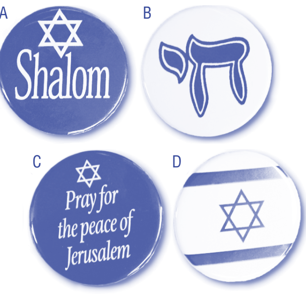
shown actual size

__ Eight of one single design: – $17 (Circle letter of choice: A, B, C, or D)