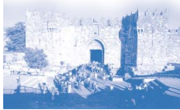
The Damascus Gate is a popular attraction.